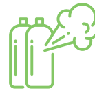
Ozone Depleting Substances

All carbon offsets are verified and validated by the industry's top independent verifiers.